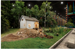
Ilkka Halso House with Garden - Unique Opportunity, 2011

It is characteristic of our society to intervene in the natural world and to use economic arguments to justify our actions. Does this mean that we see the reality of agriculture through rose-tinted spectacles? Innumerable media formats, labels, adverts and events support this view. In agriculture, imagination, and reality appear to contradict each other on a regular basis.