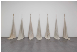
Beatrix Sitter-Liver Flerdner Heutücher - der Tod der Ahnen, 1981-89 Bündner Kunstmuseum Chur, Schenkung der Künstlerin (2017)