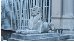
Denise Bertschi PLANTA(TIONS), 2021

Only the person who owns the land can decide how it is to be cultivated, with the question of ownership having been partly associated with ecological aspects, from the colonial era right up to the present day. Sustainable agriculture is inextricably linked with land rights. What fates await those farmers who do not own the land that they cultivate?