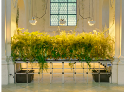
Mirko Baselgia Endozoochory Project, 2018 / 2021

only our sensory desire for the land, it also references industrial husbandry and the volatility of the earth.