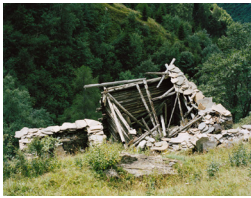
Oliver Gemperle Calanca, Ri Dedent , 2010

In Oliver Gemperle's slide projections Calanca (2010) we see signs of a migration away from the countryside in the form of abandoned farms and dilapidated barns which nature is reclaiming. The slopes to be cultivated are just too inhospitable, the profit margins too small for it to be worthwhile cultivating them. This is contrasted with the situation in Tirol, Austria. With her series of photographs Hinter den Bergen (2010) Lois Hechenblaikner displays not only a juxtaposition of generations but also economic and cultural shifts. All her pairs of pictures show both a black-and-white picture from the estate of certificated agriculturalist Armin Kniely and a color photograph by the artist.